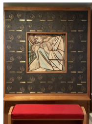
The South Chancel Wall Columbarium was completed July 2022

Please contact the church office to indicate your interest.