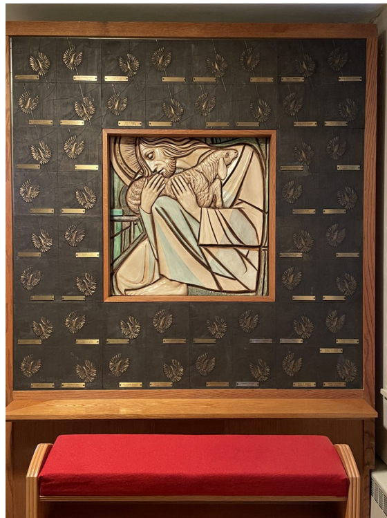
The South Chancel Wall Columbarium was completed July 2022

The size of each niche is suitable for the cremations of one or two individuals. The cost of each niche is $1,000 for interment of a single individual and $1,500 for the interment of two.